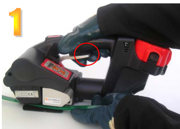
INSERT THE STRAP