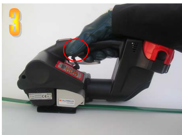
SEALING AND CUTTING PHASE